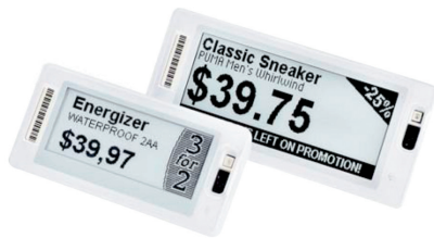
SmartTAG HD Medium, HD Large

Use segment-based LCD displays for easy updating with colored promo and price zones. All sizes fit on the same rail together with the SmartTAG HD M and L. Extensive promotional support is available by simply adding a SmartCLIP on the side of the label or a SmartFRAME around the label.