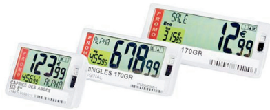
SmartTAG Small, Medium, Large

With Pricer SmartTAG labels, you will provide your store with clear, readable and reliable prices. Pricer SmartTAG labels will offer your store strong promotional capacities and enhance your customer experience.